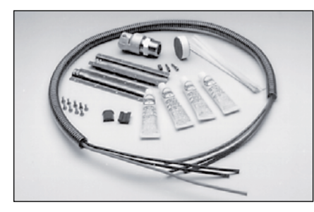
CETK: Field fabricated cold-end termination kit.

In-Line Splices: To facilitate the installation of the cable, an under insulation splice may be required. The splice utilizes a stainless steel housing (sized for the conductor type and number), splices, grounding lugs, insulating tape and sealant. Exposure temperatures up to 190°C.