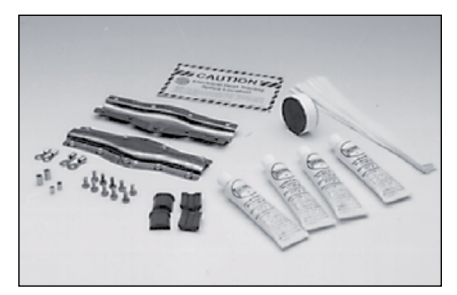
HSTK: Field fabricated splice termination kit.