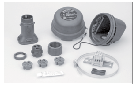
Terminator ZP-M: Designed to fabricate power connections, in-line splice connections or for making end terminations. Electrical connections are made in terminal blocks utilizing nickel-plated copper terminals to ensure corrosion-free electrical integrity. No cold leads are required. Exposure temperatures up to 250°C.

Underwriters Laboratories Inc. Hazardous (Classified) Locations