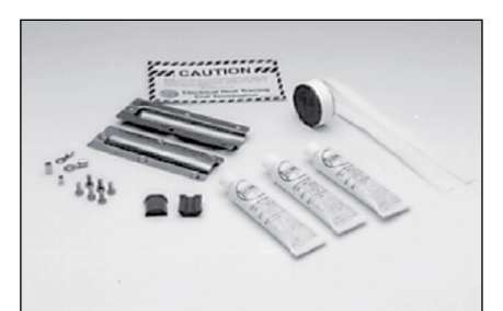
HETK: Field fabricated hot-end termination kit.